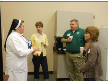
Workshop attendees enjoy a break